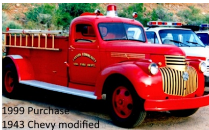
1999 Purchase 1943 Chevy modified